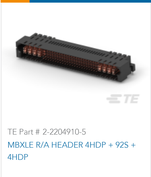
TE Part # 2-2204910-5 MBXLE R/A HEADER 4HDP + 92S + 4HDP