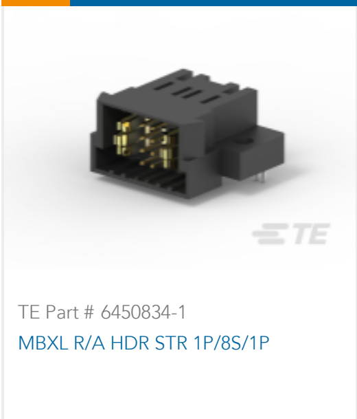
TE Part # 6450834-1 MBXL R/A HDR STR 1P/8S/1P