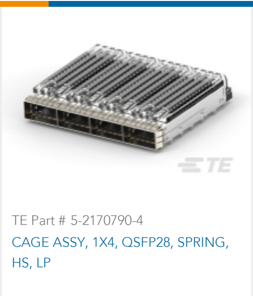
TE Part # 5-2170790-4 CAGE ASSY, 1X4, QSFP28, SPRING, HS, LP