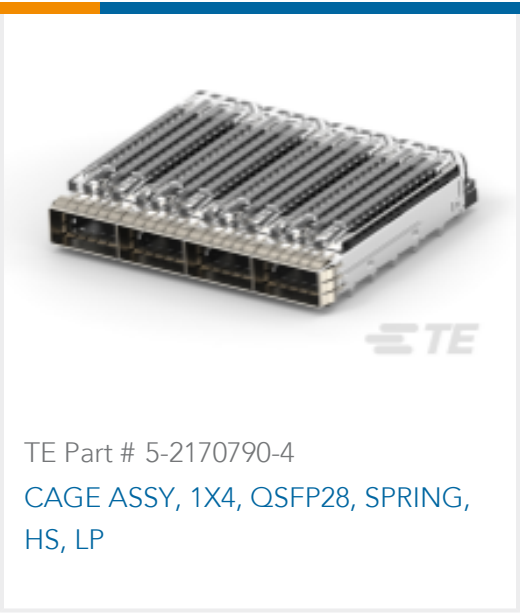
TE Part # 5-2170790-4 CAGE ASSY, 1X4, QSFP28, SPRING, HS, LP