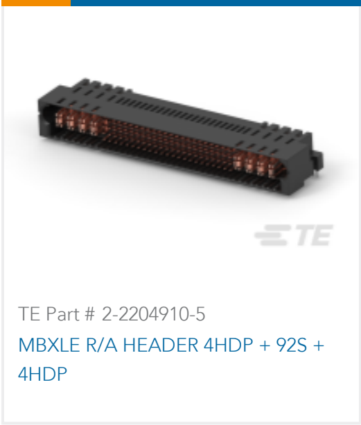
TE Part # 2-2204910-5 MBXLE R/A HEADER 4HDP + 92S + 4HDP