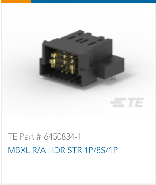
TE Part # 6450834-1 MBXL R/A HDR STR 1P/8S/1P