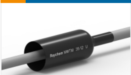
TE Part # 981425-000 MWTM-35/12-A/U-4(S30)