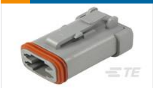
TE Part # DT06-4S-CE01 PLG, 4P, GRY, E, CAP