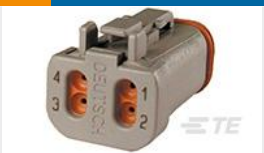
TE Part # DT06-4S-E003 PLG, 4P, GRY, N, CAP