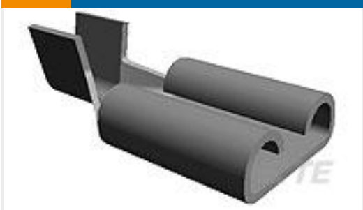
TE Part # 62850-1 110 FASTON REC 20-18 AWG TPBR