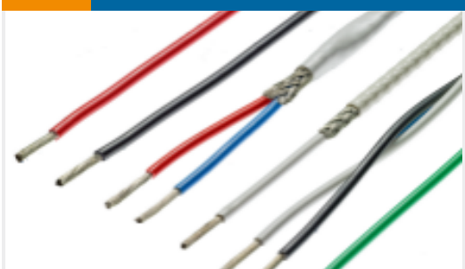
TE Part # 9395153002 FLHTC0311-26-1