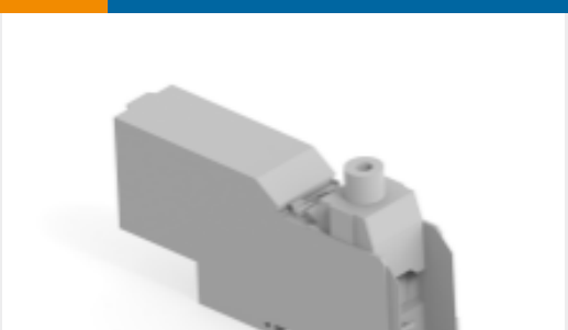
TE Part # 1SNA190008R0700 D120/42.AF