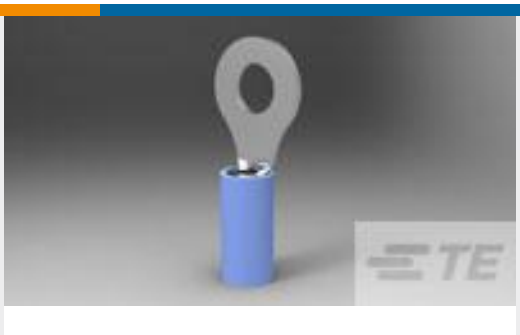
TE Part # 320563 TERMINAL, PIDG R 16-14 1/4