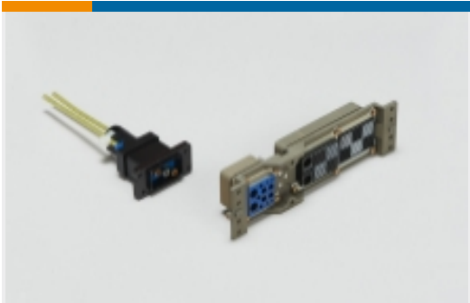
Rack & Panel Connectors(1)