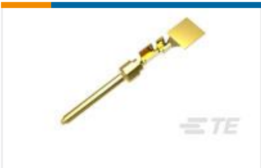
TE Part # 66507-3 20 DF PIN