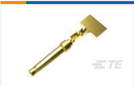
TE Part # 66505-3 20 DF SCKT CONT