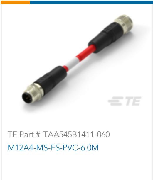
TE Part # TAA545B1411-060 M12A4-MS-FS-PVC-6.0M