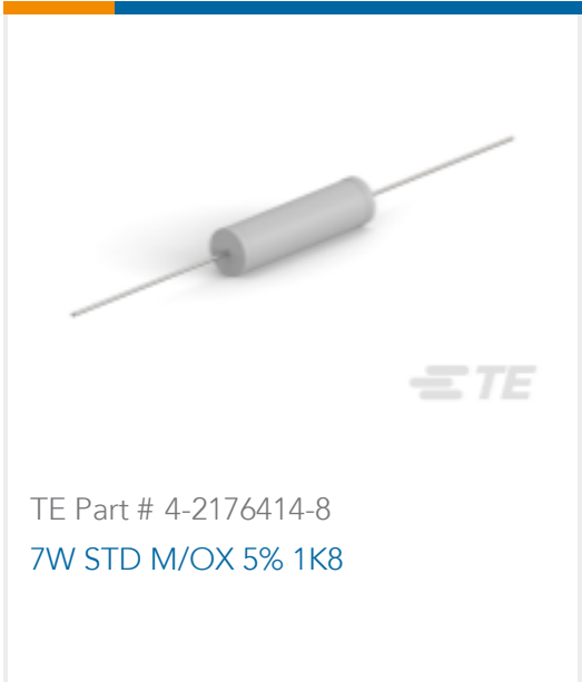
TE Part # 4-2176414-8 7W STD M/OX 5% 1K8