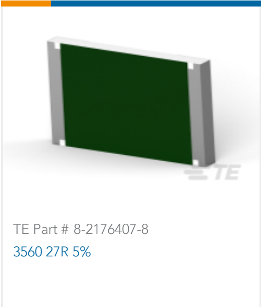
TE Part # 8-2176407-8 3560 27R 5%