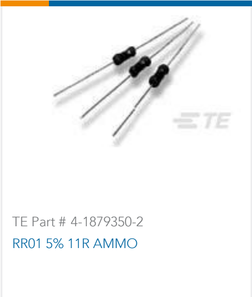
TE Part # 4-1879350-2 RR01 5% 11R AMMO