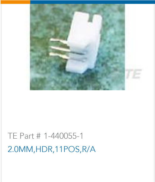
TE Part # 1-440055-1 2.0MM,HDR,11POS,R/A