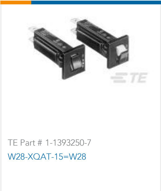
TE Part # 1-1393250-7 W28-XQAT-15=W28