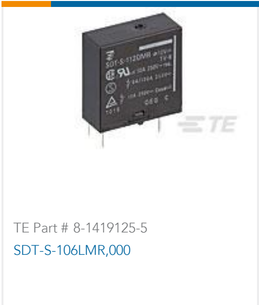
TE Part # 8-1419125-5 SDT-S-106LMR,000