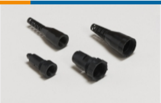
Connector Strain Relief(11)