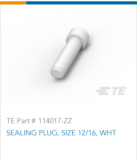
TE Part # 114017-ZZ SEALING PLUG, SIZE 12/16, WHT