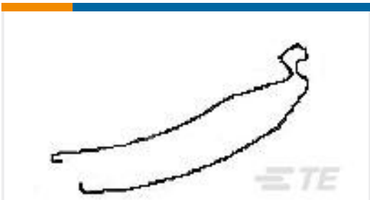
TE Part # 1-1437436-6 CR0111=34123-00-RETAINING SPRING KIT