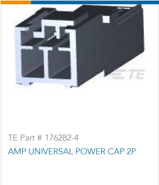
TE Part # 176282-4 AMP UNIVERSAL POWER CAP 2P