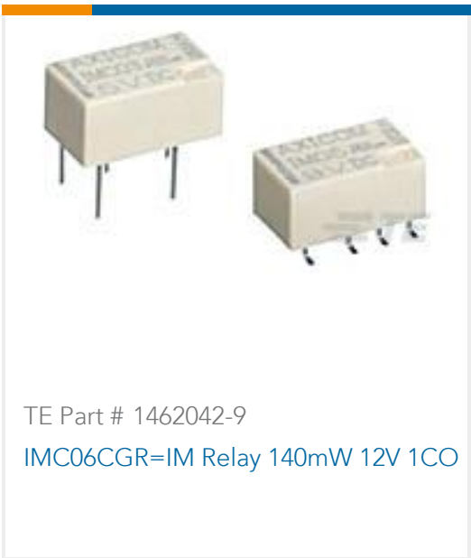
TE Part # 1462042-9 IMC06CGR=IM Relay 140mW 12V 1CO