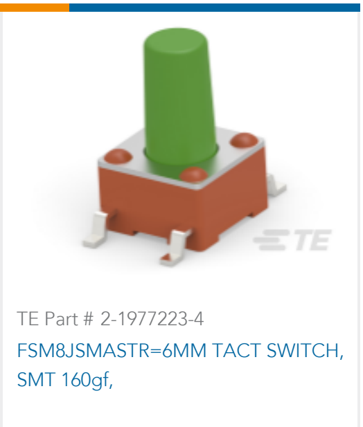
TE Part # 2-1977223-4 FSM8JSMATR=6MM TACT SWITCH, SMT 160gf,