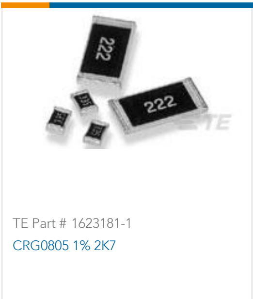
TE Part # 1623181-1 CRG0805 1% 2K7