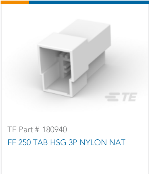
TE Part # 180940 FF 250 TAB HSG 3P NYLON NAT