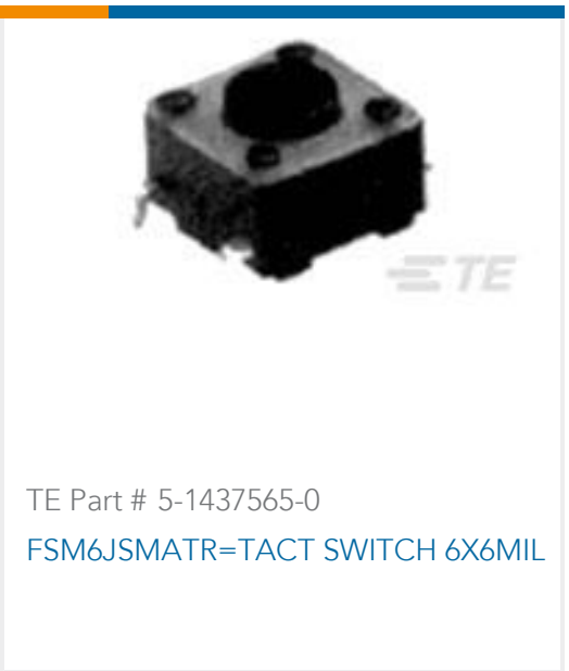
TE Part # 5-1437565-0 FSM6JSMATR=TACT SWITCH 6X6MIL