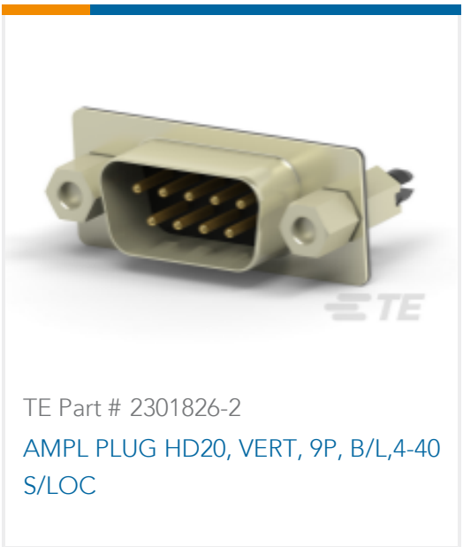
TE Part # 2301826-2 AMPL PLUG HD20, VERT, 9P, B/L,4-40 S/LOC