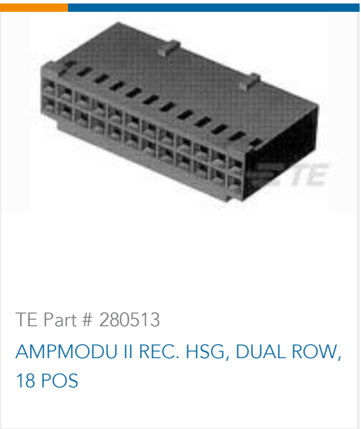
TE Part # 280513 AMPMODU II REC. HSG, DUAL ROW, 18 POS