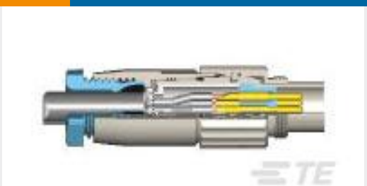
TE Part # 1-1437719-5 T01-0550-P03-MALE PLUG CONNECTOR SOLDER