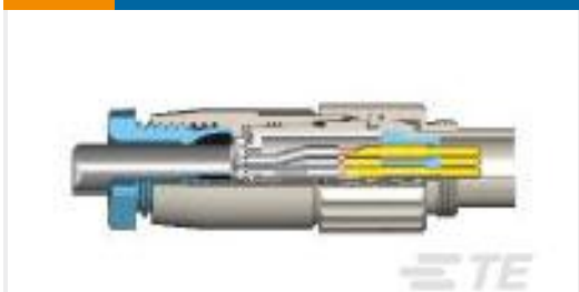
TE Part # 1-1437719-8 T01-0550-P04-MALE PLUG CONNECTOR SOLDER