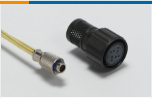
Standard Circular Connectors(14)