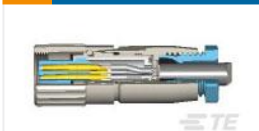
TE Part # 3-1437719-0 T01-0550-S03-FEMALE PLUG CONNECTOR SOLDE