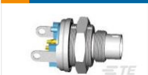
TE Part # 9-1437719-3 T01-0580-P08-MALE REC PANEL MOUNT SOLDER