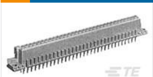
TE Part # 5650858-5 ASSEMBLY,RECEPTACLE,EUROCARD, T