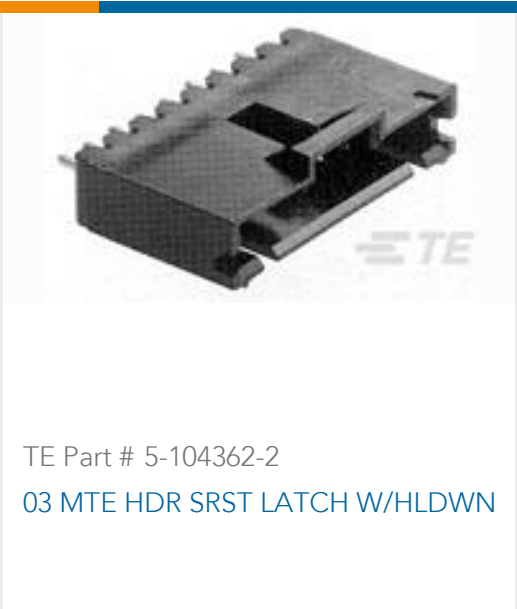
TE Part # 5-104362-2 03 MTE HDR SRST LATCH W/HLDWN