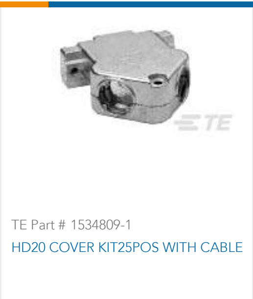
TE Part # 1534809-1 HD20 COVER KIT25POS WITH CABLE