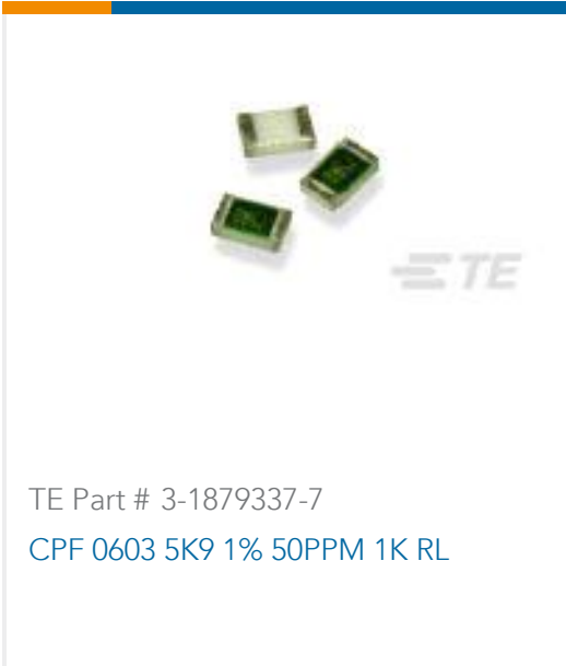
TE Part # 3-1879337-7 CPF 0603 5K9 1% 50PPM 1K RL