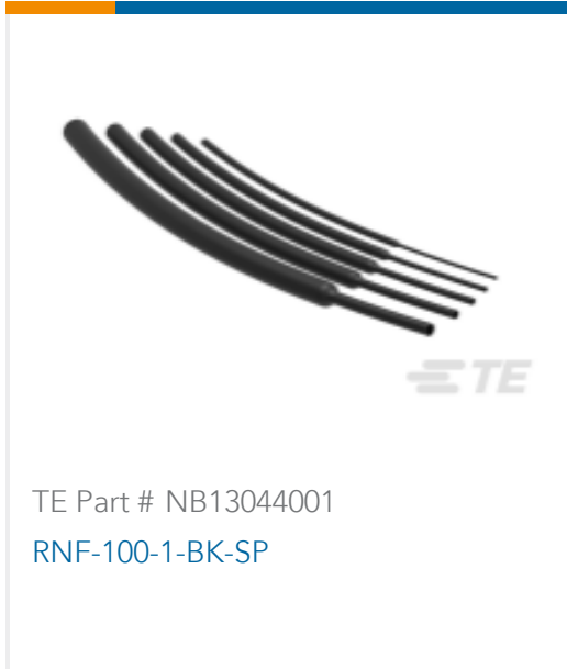
TE Part # NB13044001 RNF-100-1-BK-SP