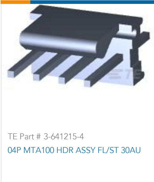
TE Part # 3-641215-4 04P MTA100 HDR ASSY FL/ST 30AU