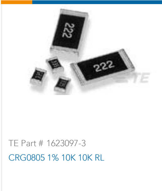
TE Part # 1623097-3 CRG0805 1% 10K 10K RL