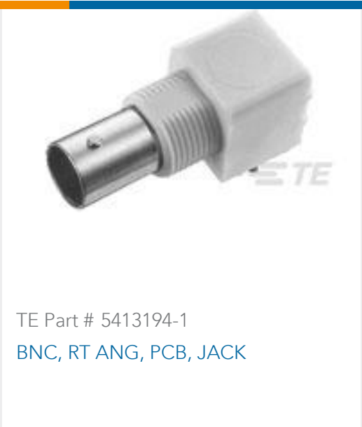
TE Part # 5413194-1 BNC, RT ANG, PCB, JACK