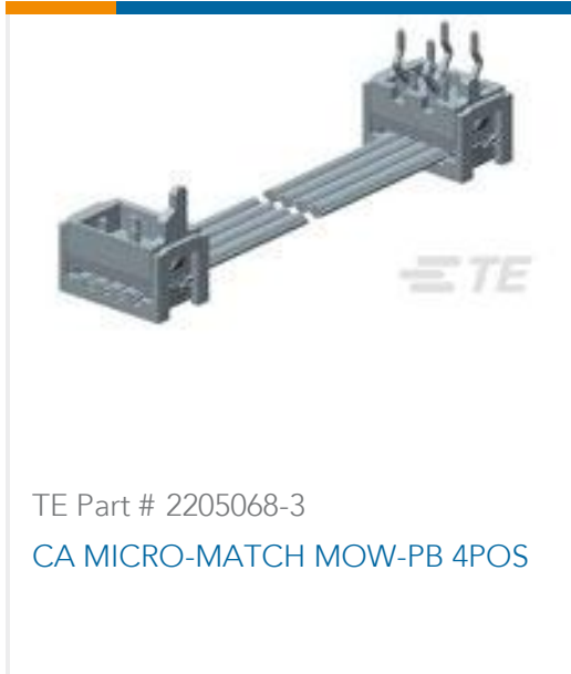
TE Part # 2205068-3 CA MICRO-MATCH MOW-PB 4POS