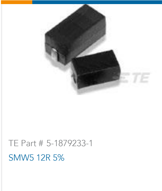
TE Part # 5-1879233-1 SMW5 12R 5%