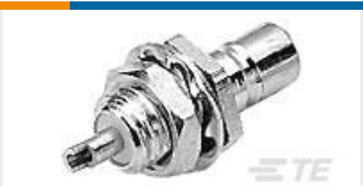
TE Part # 1-1337480-0 SMB FM BHSkt 50Ohm Gold Pltd