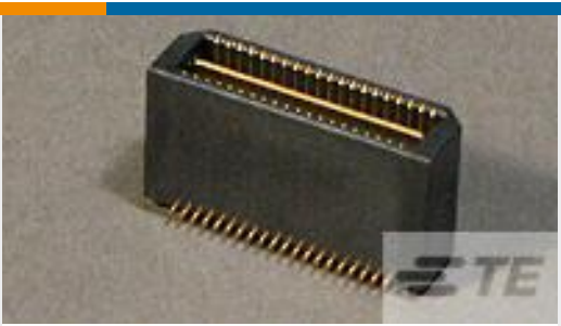
TE Part # 1658015-1 MSB0.80PL11ASY040FL,-,10,-TY