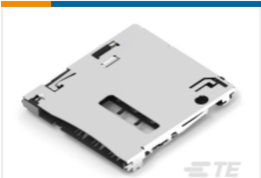
TE Part # 2822541-1 PUSH-PUSH MICRO SIM CONNECTOR