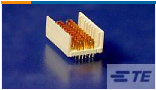
TE Part # 6469025-1 HM-ZD 2PR HDR 40P 2.5MM