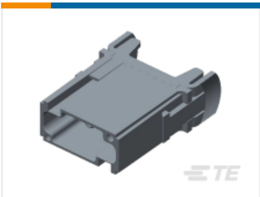
TE Part # T2111062101-000 HMN-006-M