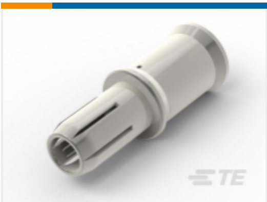
TE Part # T2400002160-000 CSF-16