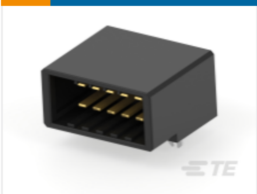
TE Part # 178308-2 Header Assembly: Wire-to-Board, 15A, gold or tin plated