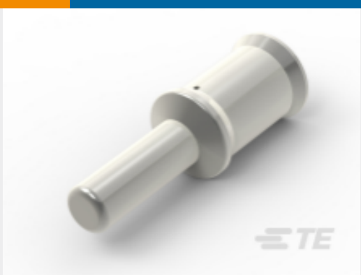
TE Part # T2400001250-000 CSM-25