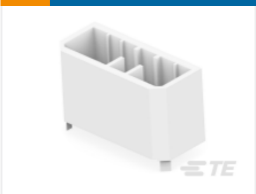
TE Part # 172034-1 MIC CAP 11P V