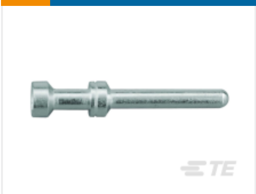
TE Part # T2030001008-000 CEM-0.75