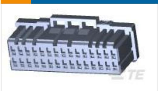
TE Part # 1-1827863-5 DYNAMIC 1100D REC HSG 30P X BLACK