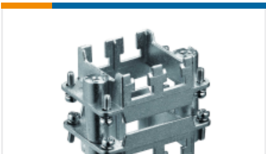
TE Part # T2070244101-000 H24BN-T6-M