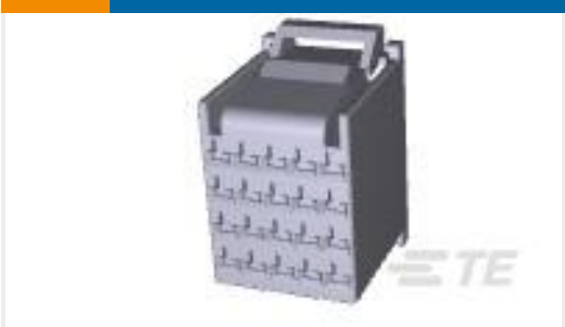
TE Part # 917249-1 DYNAMIC D-3400F REC HSG 20P