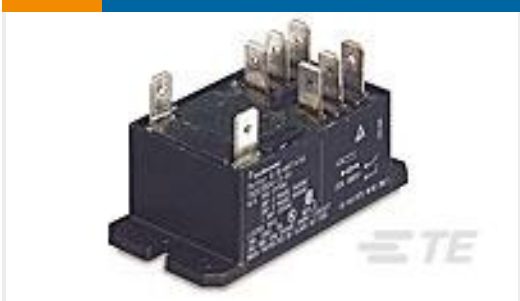
TE Part # 1-1393212-7 T92S7D22-24