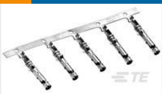
TE Part # 1-66331-4 III+ SKT,24-20,TIN,STRIP