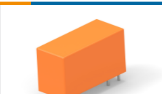
TE Part # 3-1649329-3 RT444024