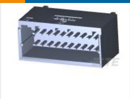
TE Part # 1-1827872-1 DYNAMIC 1100D HDR ASSY V 22P BLACK GOLD