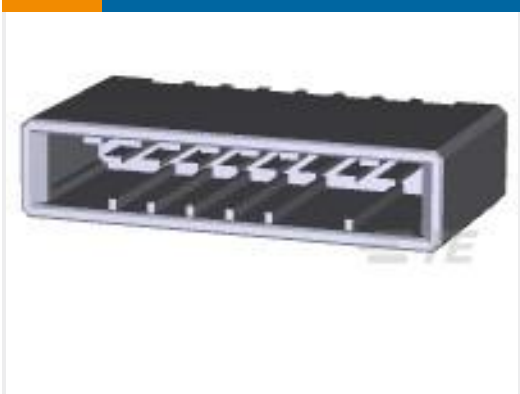
TE Part # 1-178317-3 DYNAMIC S/ROW HDR 8P V ASSY