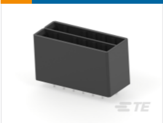
TE Part # 2-178139-2 Header Assembly: Wire-to-Board, 15A, gold or tin plated