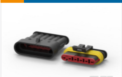
TE Part # 282104-1 AMP SUPERSEAL 1.5MM, CONNECTOR HOUSING