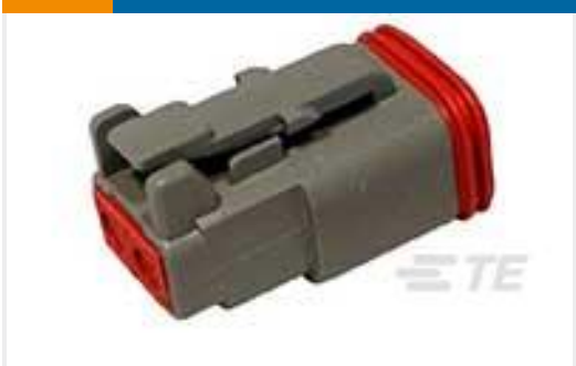
TE Part # DT06-2S PLG, 2P, GRY, N