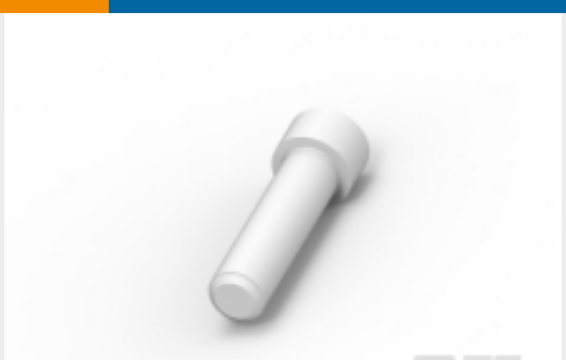
TE Part # 114017-ZZ SEALING PLUG, SIZE 12/16, WHT

Product Drawings GIC 3.3 PLUG HSG BLUE English