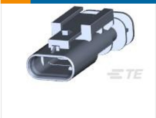
TE Part # 1-1703494-4 3POS, MCON 1.2 LL TAB SEALED COD A