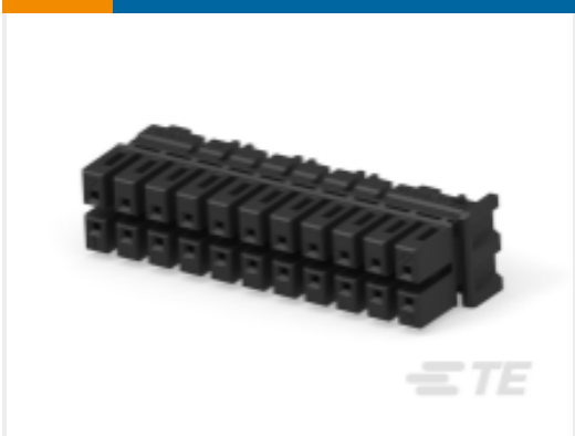
TE Part # 2404687-1 PICO 22P REC HSG