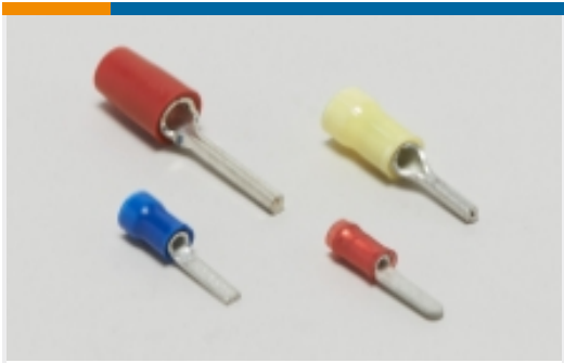
Crimp Wire Pins, Tabs & Ferrules(1)