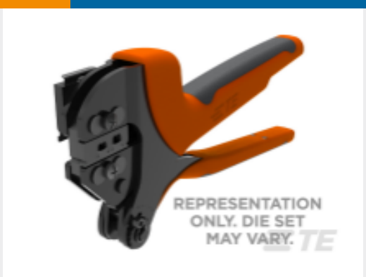
TE Part # 2390277-1 SDE F JR PWR TIMER 1.50-2.50mm2 ASSY