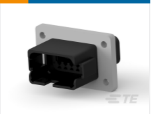
TE Part # DT04-12PA-BL06 REC, 12P, BLK, E, ENH KEY, FLANGE, A