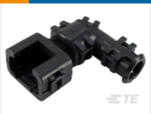
TE Part # 2302491-1 SOC CONN CVRASSY,2POS, AMPSEAL16,90DEG,MC