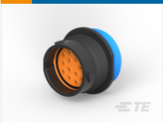
TE Part # 2293822-1 HDP24-24-16PE-L024, REC, 16P, E, THD,12,P