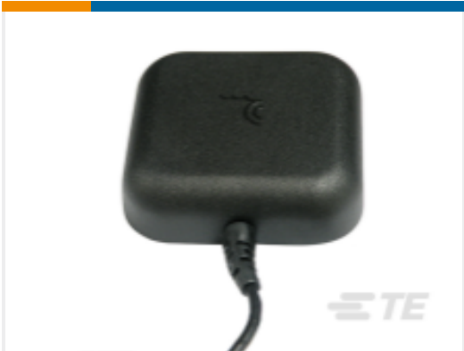
TE Part # HIRD-MX-0106A-02 IRD LP M/SMA/1.5