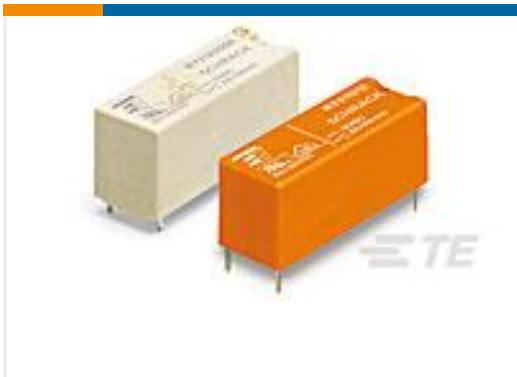
TE Part # 1-1956170-6 RY211012R