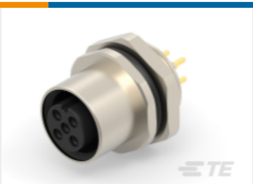
TE Part # T4143012051-000 M12,FRONT MOUNTING,FEMALE,A CODE,5P