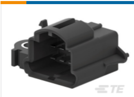
TE Part # 828801-5 Low & Medium Power Header