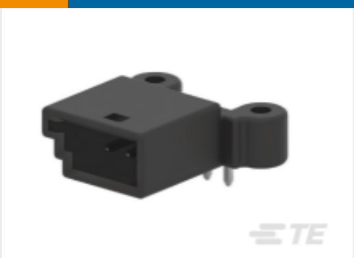
TE Part # 1318853-2 Signal Header