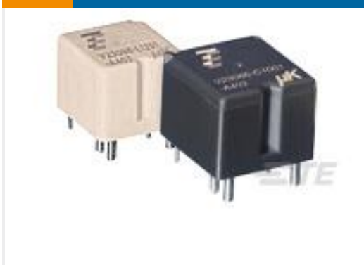
TE Part # 1393280-5 V23086C1001A402