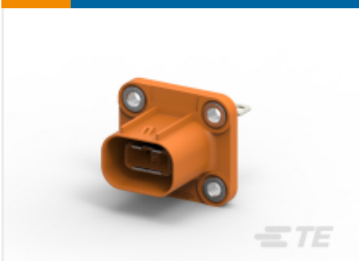
TE Part # 2229745-1 HVA280 HEADER ASSY, KEY A, ORANGE