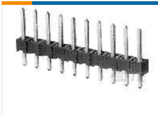
TE Part # 2-825433-0 MOD 2 PINHDR 1X20P.