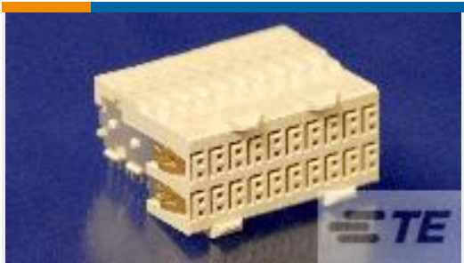
TE Part # 6469028-1 HM-ZD 2PR RECP 40P