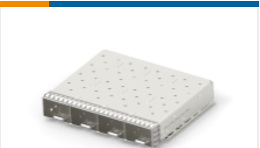
TE Part # 2300275-1 zSFP+ 1x4 Cage Assembly, Press-Fit