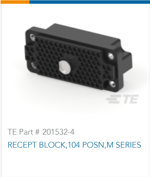
TE Part # 201532-4 RECEPT BLOCK, 104 POSN, M SERIES

This information is provided based on reasonable inquiry of our suppliers and represents our current actual knowledge based on the information they provided. This information is subject to change. The part numbers that TE has identified as EU RoHS compliant have a maximum concentration of 0.1% by weight in homogenous materials for lead, hexavalent chromium, mercury, PBB, PBDE, DBP, BBP, DEHP, DIBP, and 0.01% for cadmium, or qualify for an exemption to these limits as defined in the Annexes of Directive 2011/65/EU (RoHS2). Finished electrical and electronic equipment products will be CE marked as required by Directive 2011/65/EU. Components may not be CE marked. Additionally, the part numbers that TE has identified as EU ELV compliant have a maximum concentration of 0.1% by weight in homogenous materials for lead, hexavalent chromium, and mercury, and 0.01% for cadmium, or qualify for an exemption to these limits as defined in the Annexes of Directive 2000/53/EC (ELV). Regarding the REACH Regulation, the information TE provides on SVHC in articles for this part number is based on the latest European Chemicals Agency (ECHA) 'Guidance on requirements for substances in articles' posted at this URL: https://echa.europa.eu/guidance-documents/guidance-on-reach