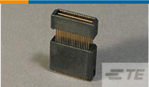
TE Part # 1-1658051-1 MSB0.80PL30ASY28DP,-,F,VCTY