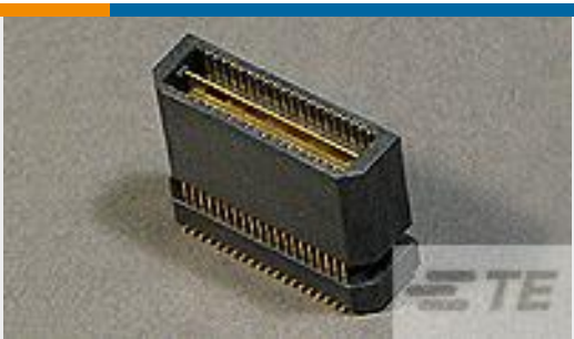
TE Part # 1-1658047-1 MSB0.80PL16ASY28DP,-,F,VCTY