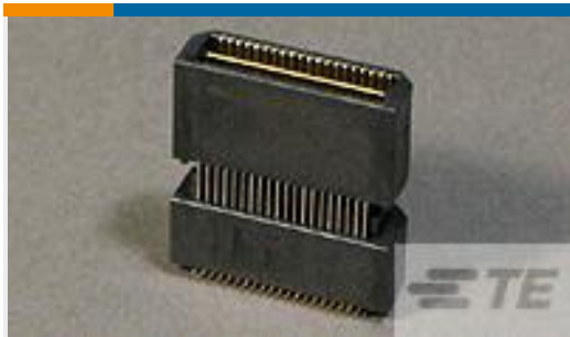
TE Part # 1-1658049-1 MSB0.80PL22ASY28DP,-,F,VCTY