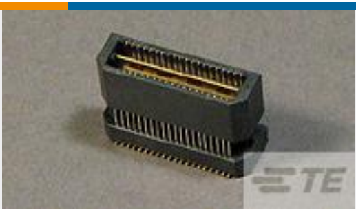
TE Part # 1-1658437-1 MSB0.80PL14ASY28DP,-,F,VCTY