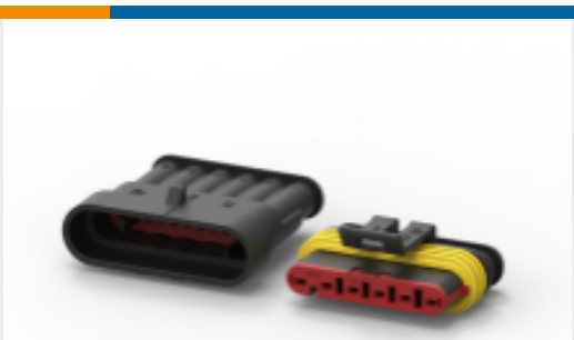
TE Part # 282104-1 AMP SUPERSEAL 1.5MM, CONNECTOR HOUSING