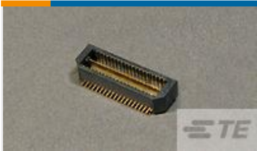
TE Part # 1-1658044-1 MSB0.80PL5ASY28DP,-,F,VCTY