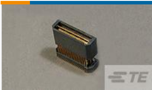
TE Part # 1-1658048-1 MSB0.80PL19ASY28DP,-,F,VCTY