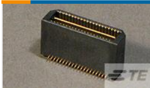
TE Part # 1-1658046-1 MSB0.80PL11ASY28DP,-,F,VCTY