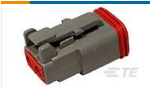
TE Part # DT06-2S PLG, 2P, GRY, N