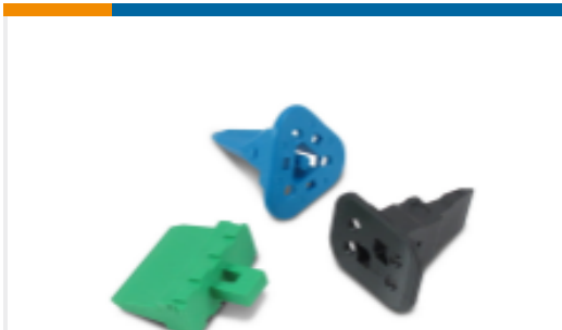
TE Part # W2S Wedgelocks: DEUTSCH DT