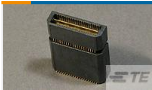
TE Part # 1-1658050-1 MSB0.80PL25ASY28DP,-,F,VCTY