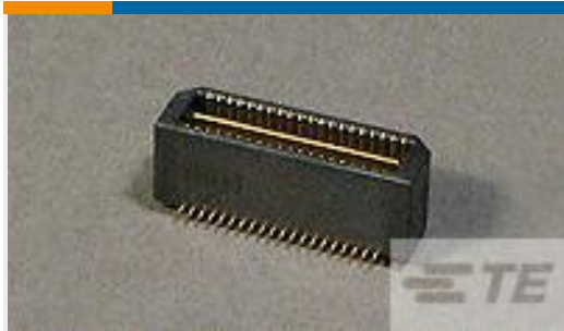
TE Part # 1-1658045-1 MSB0.80PL8ASY28DP,-,F,VCTY