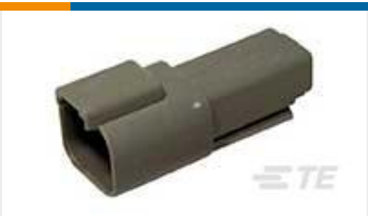
TE Part # DT04-2P REC, 2P, GRY, N