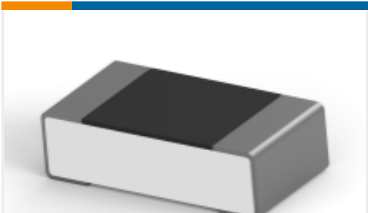
TE Part # 1-2176368-9 RQ 0603 76K8 0.1% 10PPM 1K RL