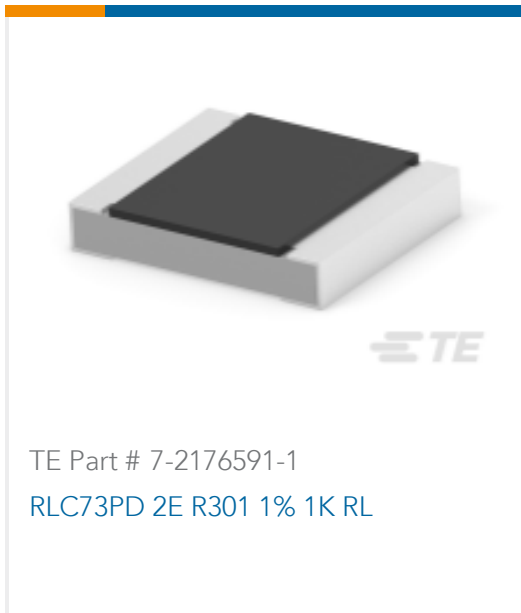
TE Part # 7-2176591-1 RLC73PD 2E R301 1% 1K RL