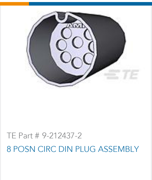
TE Part # 9-212437-2 8 POSN CIRC DIN PLUG ASSEMBLY