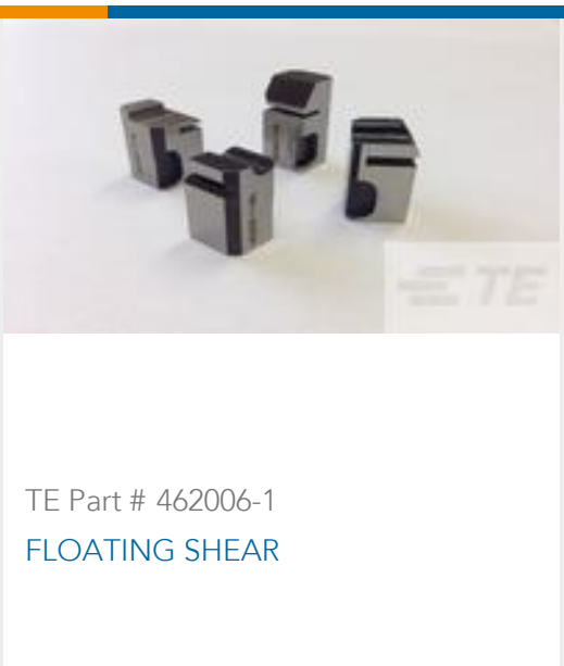
TE Part # 462006-1 FLOATING SHEAR