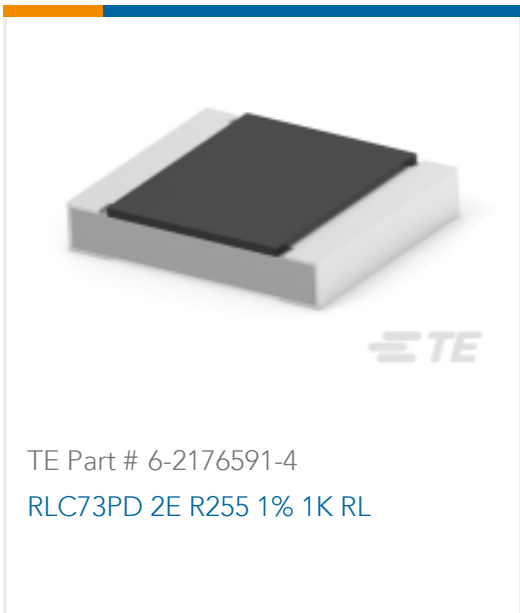
TE Part # 6-2176591-4 RLC73PD 2E R255 1% 1K RL