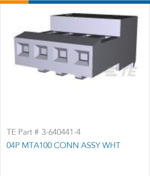
TE Part # 3-640441-4 04P MTA100 CONN ASSY WHT