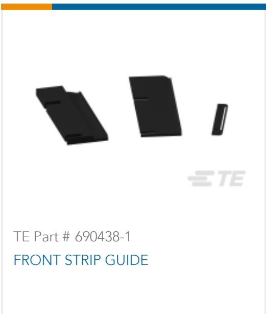
TE Part # 690438-1 FRONT STRIP GUIDE