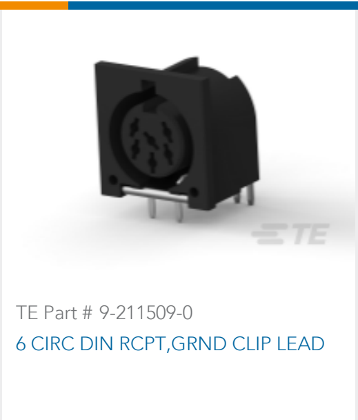
TE Part # 9-211509-0 6 CIRC DIN RCPT,GRND CLIP LEAD