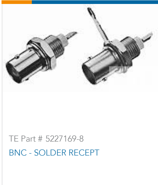
TE Part # 5227169-8 BNC - SOLDER RECEPT