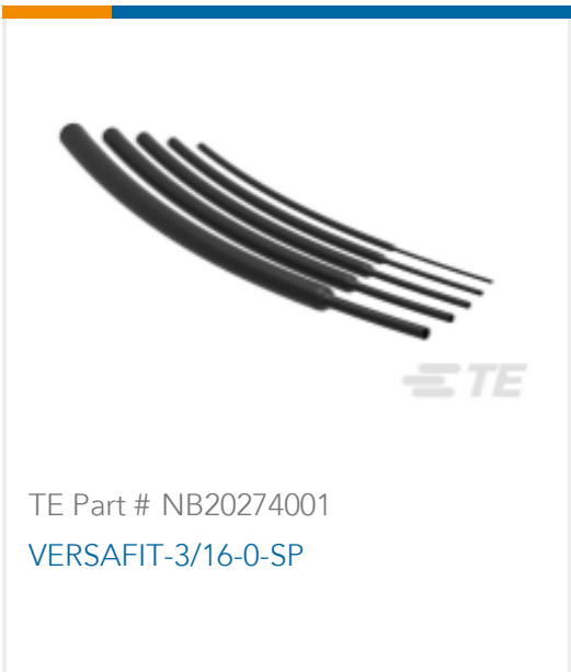
TE Part # NB20274001 VERSAFIT-3/16-0-SP