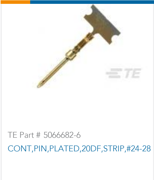
TE Part # 5066682-6 CONT,PIN,PLATED,20DF,STRIP,#24-28