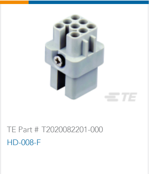
TE Part # T2020082201-000 HD-008-F