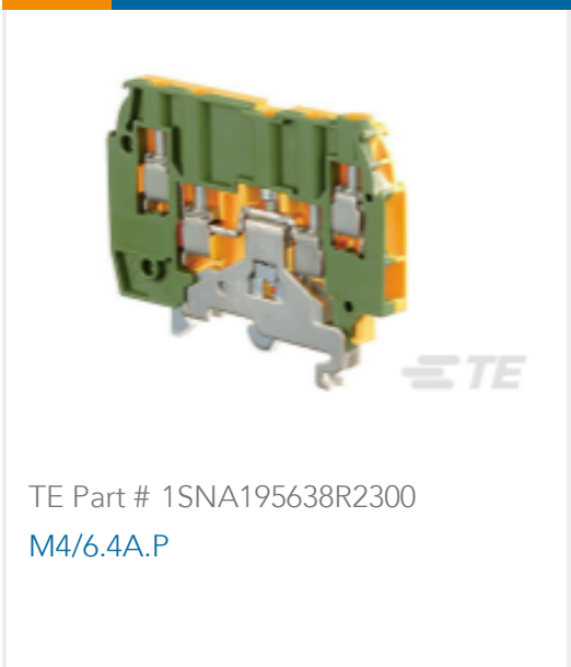
TE Part # 1SNA195638R2300 M4/6.4A.P