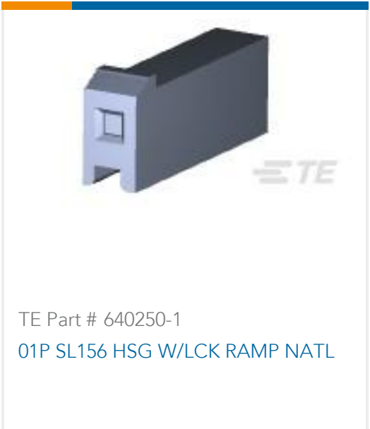
TE Part # 640250-1 01P SL156 HSG W/LCK RAMP NATL