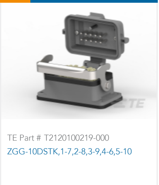
TE Part # T2120100219-000 ZGG-10DSTK,1-7,2-8,3-9,4-6,5-10