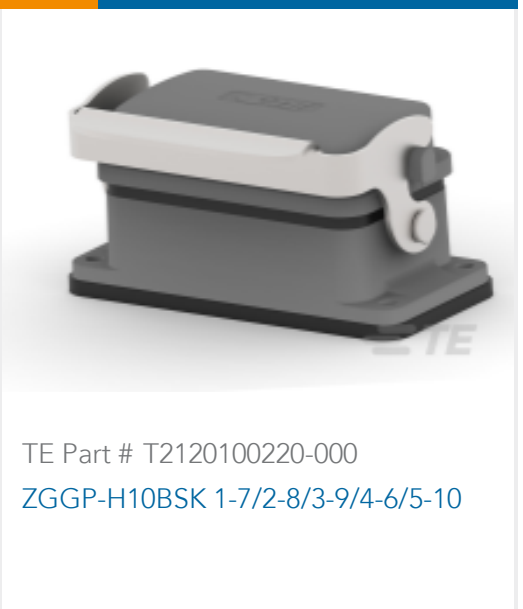
TE Part # T2120100220-000 ZGGP-H10BSK 1-7/2-8/3-9/4-6/5-10