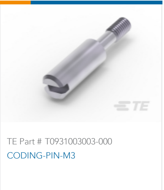
TE Part # T0931003003-000 CODING-PIN-M3