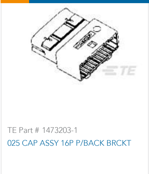
TE Part # 1473203-1 025 CAP ASSY 16P P/BACK BRCKT