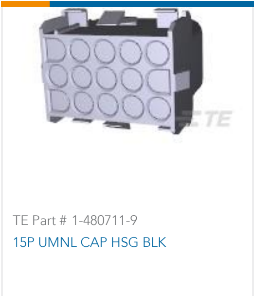
TE Part # 1-480711-9 15P UMNL CAP HSG BLK