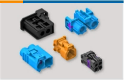
Data Connectivity Housings(3)