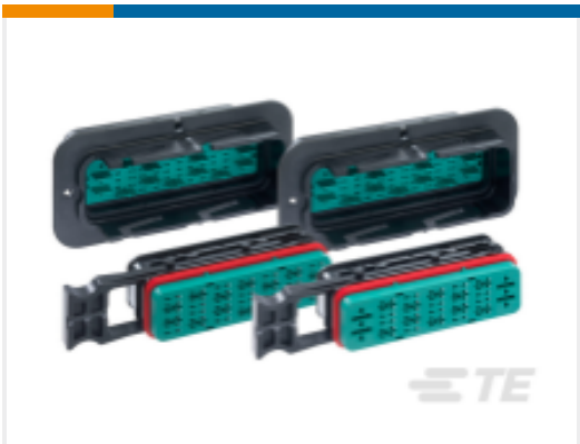
TE Part # 2500006-1 SRC Pwr 60+6AG Female Recp Hsg Assy 2.5