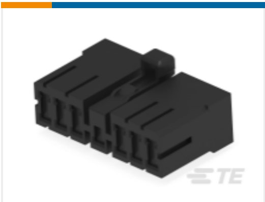
TE Part # 172498-1 MIC PLUG HSG 13P (MK II)