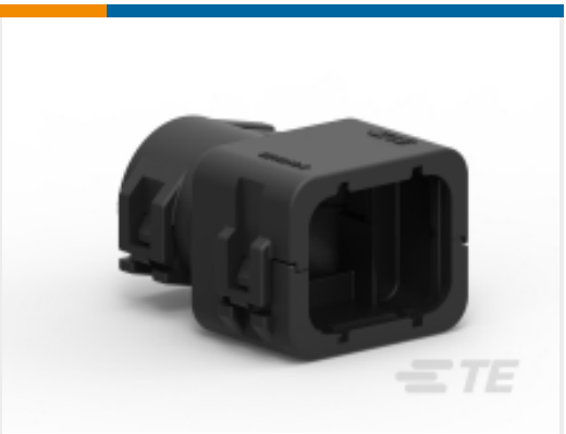
TE Part # 2292863-3 AS16 BACKSHELL, 6P CAP, NC12, MC