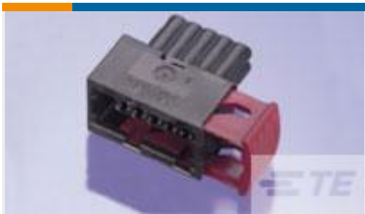
TE Part # 966500-1 JPT GEH KOMPL 24P