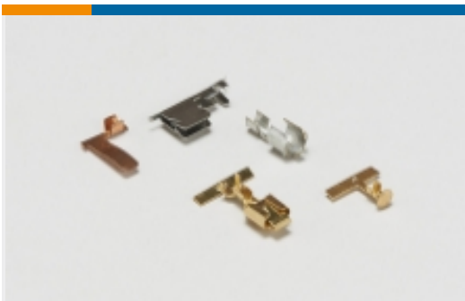
Special Purpose Terminals(2)