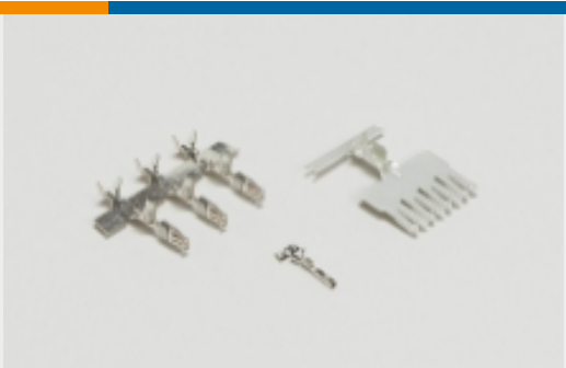
Busbars & Terminals(1)