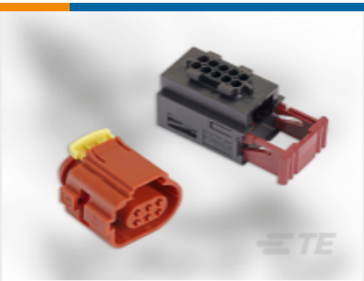
TE Part # 1-964449-1 Timer Connector Housing