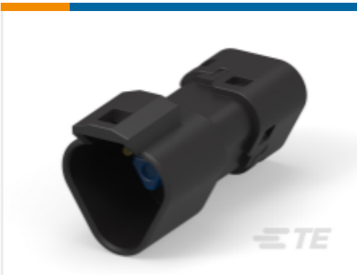
TE Part # 2332444-1 DT04-3P-EP10-120,RECEPTACLE ASM-BLACK