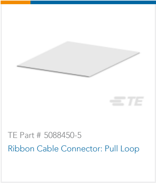
TE Part # 5088450-5 Ribbon Cable Connector: Pull Loop