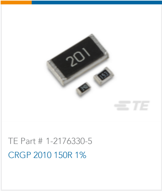
TE Part # 1-2176330-5 CRGP 2010 150R 1%