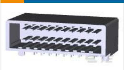
TE Part # 178308-3 DYNAMIC D-3 HDR ASSY H 20P