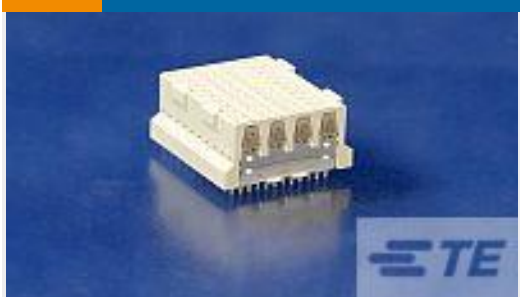
TE Part # 1469362-1 HM-ZD VERT RECPT ASSY 18MM