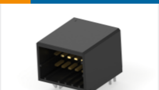
TE Part # 1376020-2 Header Assembly: Wire-to-Board, 5A, gold plated