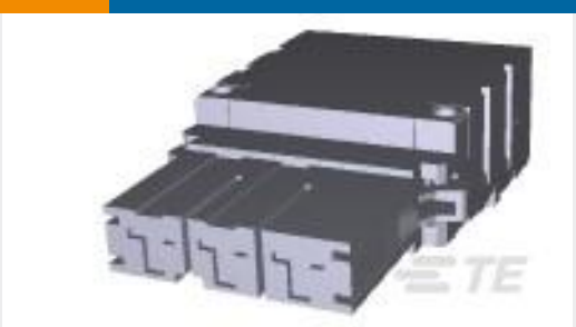
TE Part # 1473668-1 KIT D-5 (D-5 DYNA-CLAMP 3P)