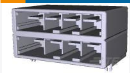
TE Part # 1123829-1 DYNAMIC D-5200 HDR H ASSY 8P