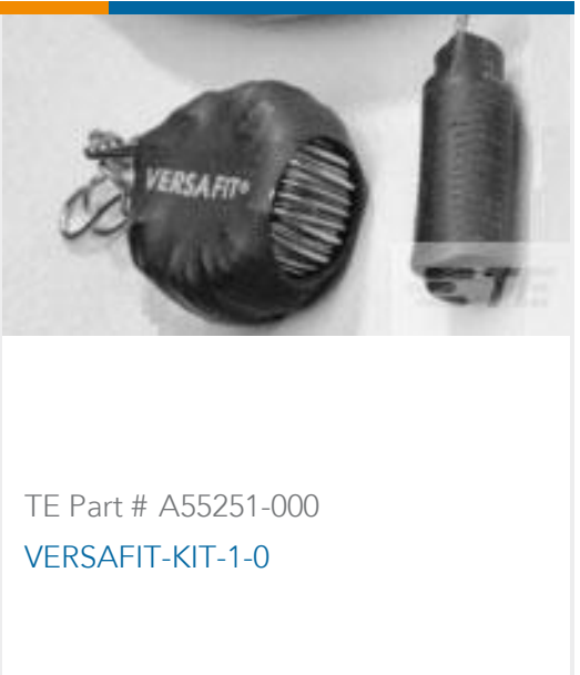
TE Part # A55251-000 VERSAFIT-KIT-1-0

Product Drawings TAB,PIDG TERMI-BK 12-10 English