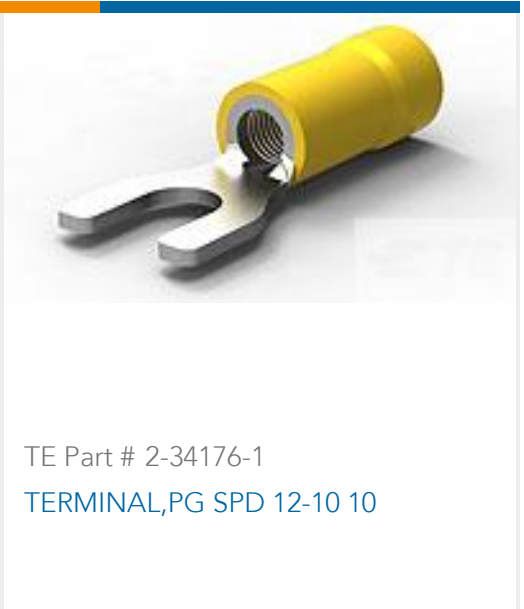
TE Part # 2-34176-1 TERMINAL,PG SPD 12-10 10