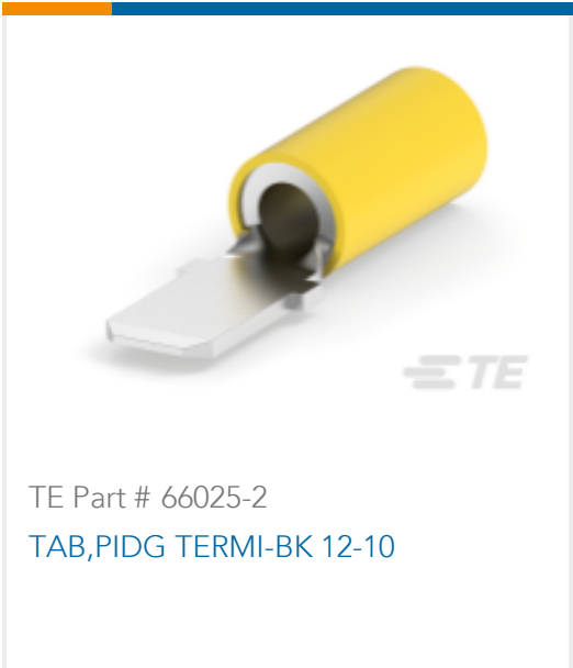
TE Part # 66025-2 TAB,PIDG TERMI-BK 12-10