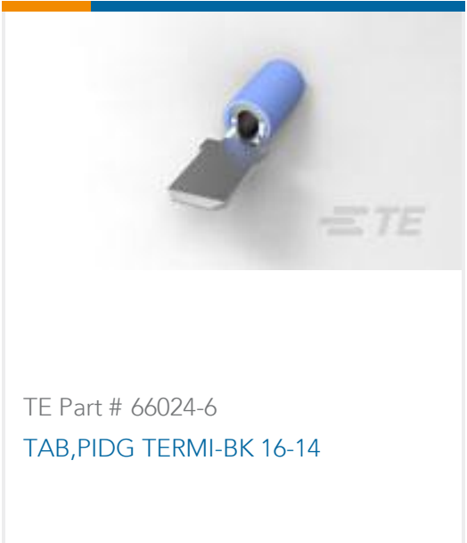
TE Part # 66024-6 TAB,PIDG TERMI-BK 16-14