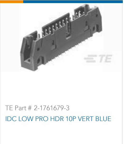
TE Part # 2-1761679-3 IDC LOW PRO HDR 10P VERT BLUE