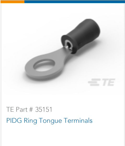
TE Part # 35151 PIDG Ring Tongue Terminals