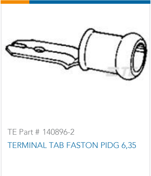
TE Part # 140896-2 TERMINAL TAB FASTON PIDG 6,35