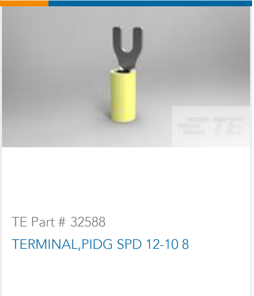
TE Part # 32588 TERMINAL,PIDG SPD 12-10 8