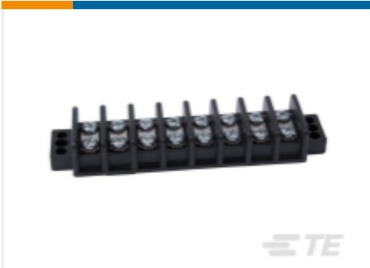
TE Part # CA7326-000 CPGI-1546310-8