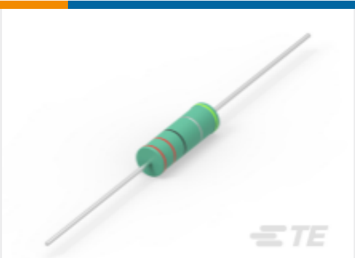
TE Part # 2176613-5 EP 4W (SS) 1R5 5%