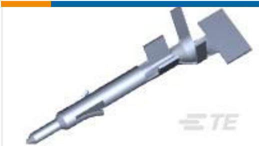
TE Part # 171638-1 MINI U-M-N-L PIN CONT. L.P