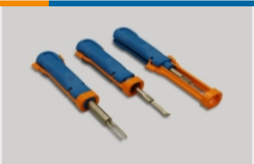
Insertion & Extraction Tools(42)