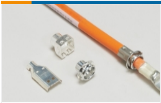
Automotive Connector EMC Shielding (3)