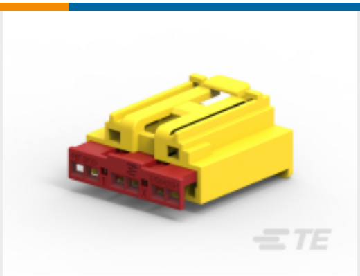
TE Part # 1564003-1 6POS,GET 0.64,REC HSG,ASSY