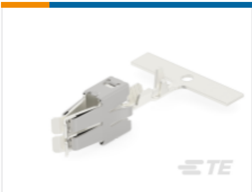
TE Part # 1862029-5 SPT REC 6.3 Contact SRC Ag