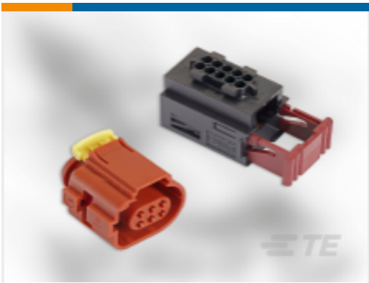
TE Part # 1-968307-2 Timer Connector Housing