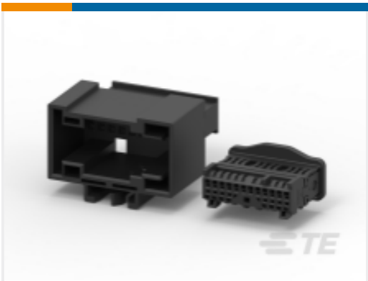
TE Part # 1-1438608-3 MQS, CONNECTOR HOUSING