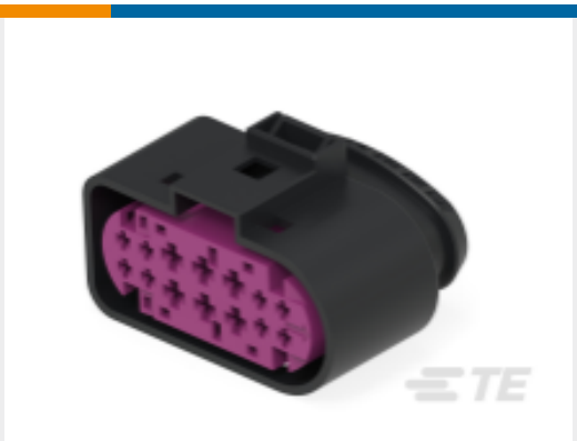
TE Part # 5-1719105-1 14POS,JPT,REC.HSG,BK