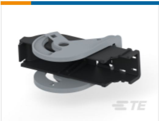
TE Part # 3-2209521-1 REC CONN CVR ASSY,46POS,MCON 12,90 DEG