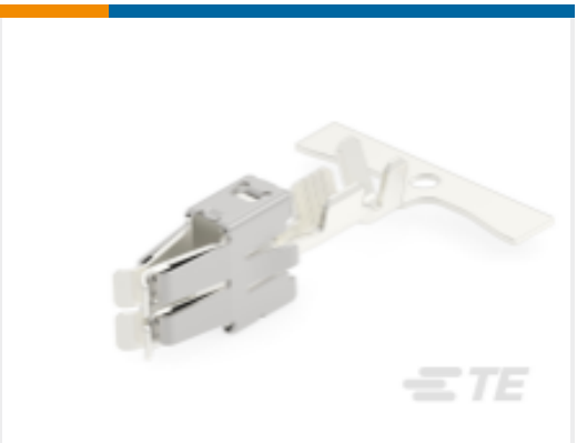
TE Part # 1862028-5 SPT REC 6.3 Contact SRC Ag