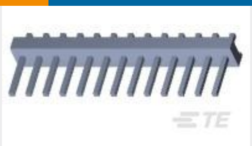
TE Part # 1-640383-3 13P MTA156 HDR ASSY STR SQ SN