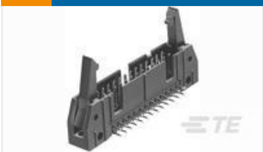
TE Part # 5499345-1 A/L UNIV HDR 10P RA SHT LAT