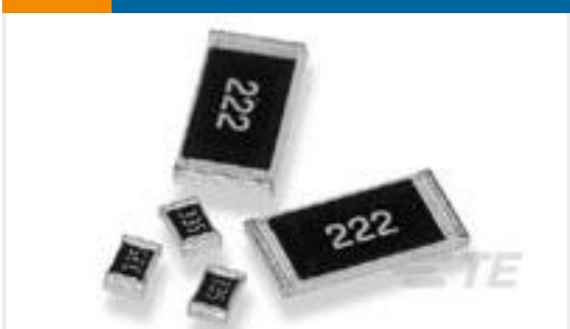
TE Part # 1623266-1 CRG0805 1% 620R