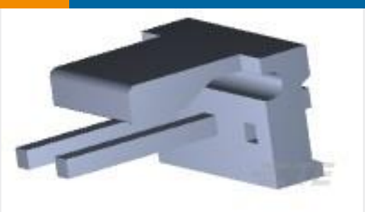
TE Part # 641937-3 03P MTA156 HDR ASSY SQ W/O#1

Product Drawings UNIVERSAL HEADER LATCH English