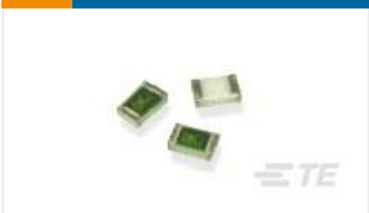
TE Part # 3-2176091-6 RP 2A 0.25W 133R 0.1% 25PPM 1K RL