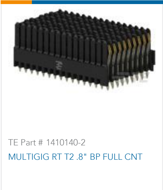
TE Part # 1410140-2 MULTIGIG RT T2 .8" BP FULL CNT