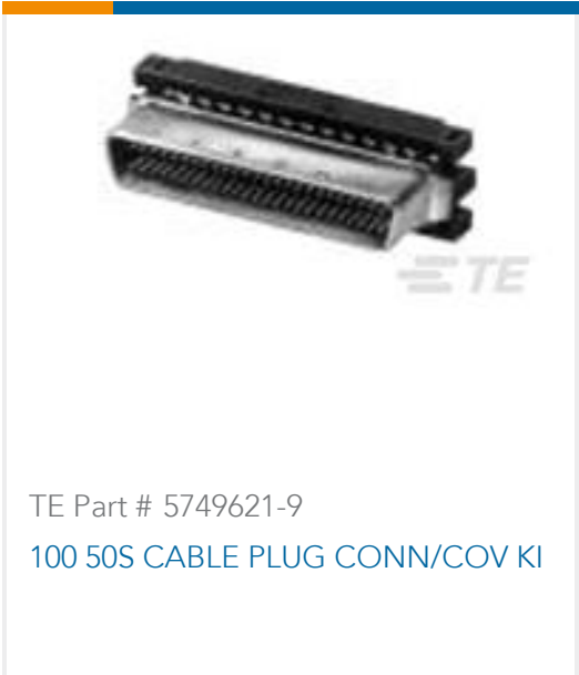
TE Part # 5749621-9 100 50S CABLE PLUG CONN/COV KI