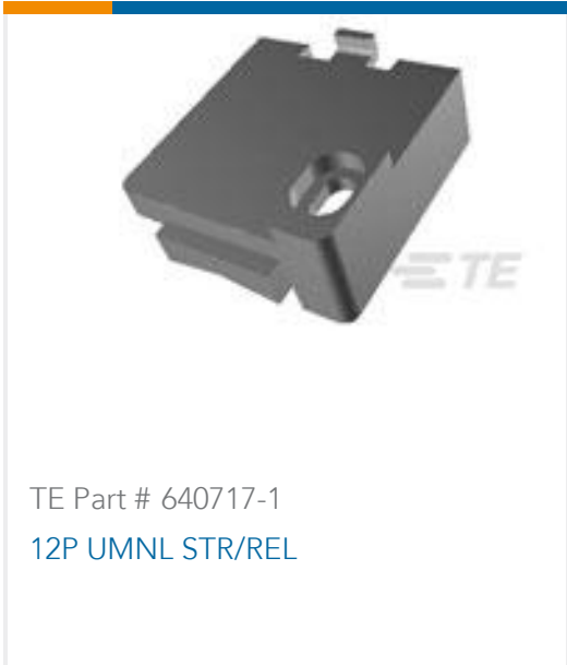
TE Part # 640717-1 12P UMNL STR/REL