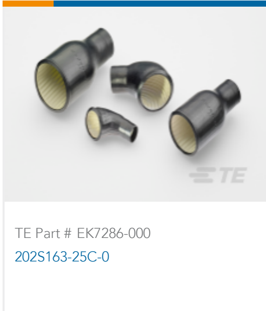
TE Part # EK7286-000 202S163-25C-0