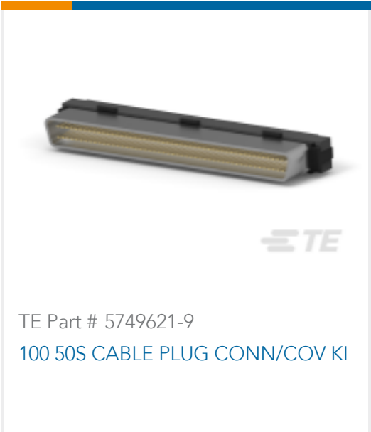
TE Part # 5749621-9 100 50S CABLE PLUG CONN/COV KI