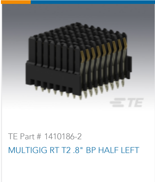
TE Part # 1410186-2 MULTIGIG RT T2 .8" BP HALF LEFT