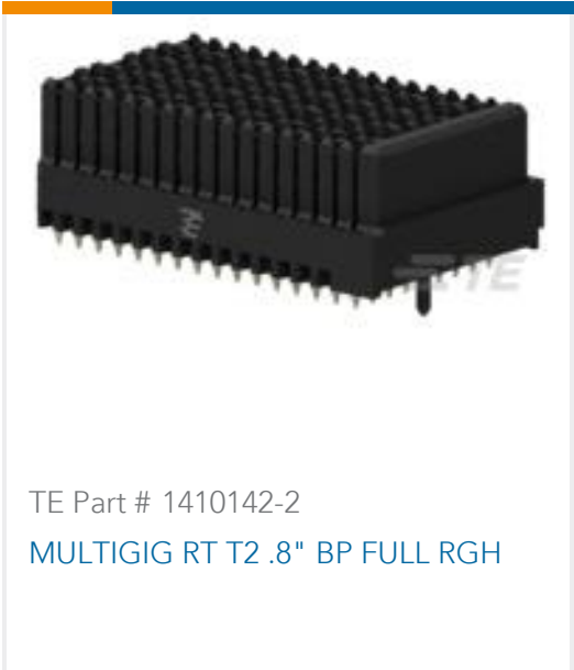
TE Part # 1410142-2 MULTIGIG RT T2 .8" BP FULL RGH