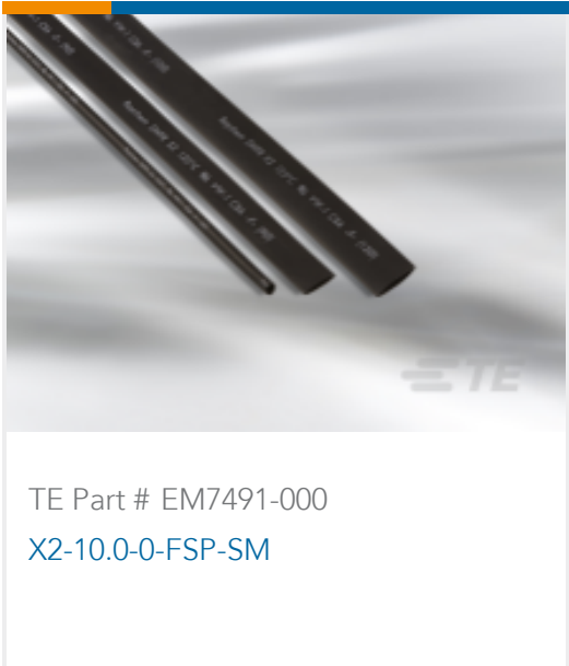
TE Part # EM7491-000 X2-10.0-0-FSP-SM