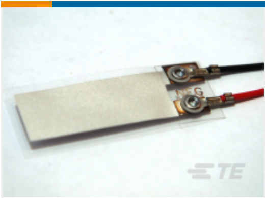
TE Part # 11029806-00 LDT2-028K W/TH LEADS/RIVE