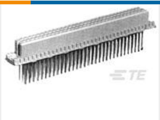
TE Part # 5148057-5 ASSY,RECEPTACLE,EUROCARD,TYPE C,LEAD-FRE