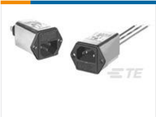
TE Part # 6609115-3 1EGG1-2 (NEW GEN=F7642D S0