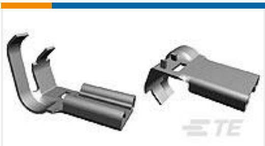
TE Part # 42232-3 250 FASTON FLAG REC 18-12 AWG TPBR