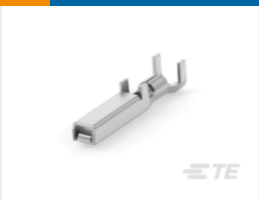
TE Part # 1-175217-3 Contact: Component To Wire; 15A, 28-14 wire size