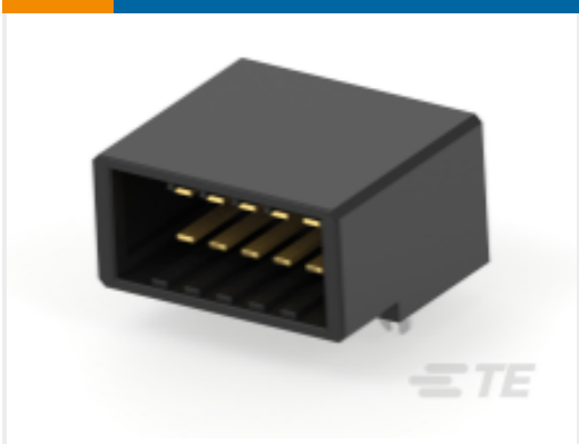
TE Part # 2-178313-3 Header Assembly: Wire-to-Board, 15A, gold or tin plated