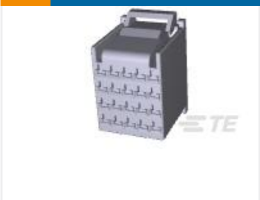
TE Part # 917249-1 DYNAMIC D-3400F REC HSG 20P