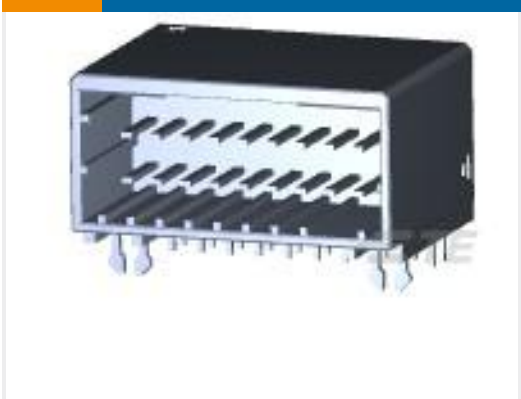
TE Part # 1376137-2 DYNAMIC D2100 HDR H ASSY 20P Y