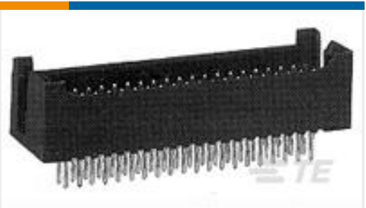
TE Part # 5-102567-1 12 MODII 2PC HDR DR SHRD .100, ROHS