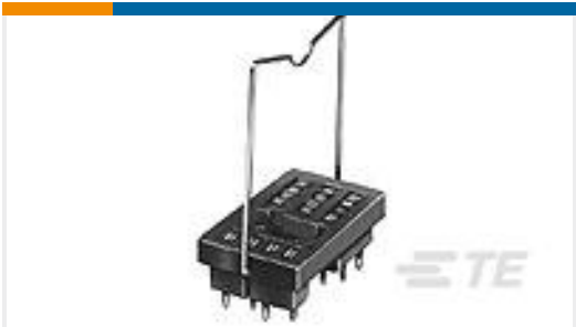
TE Part # 3-1393159-7 20C251=SPRING,HOLD-DOWN,R10,.0