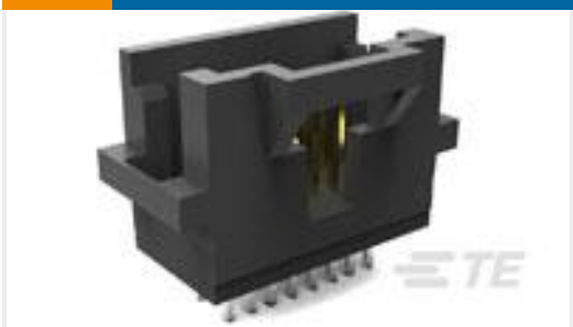
TE Part # 104068-2 10 SYSTEM 50 HDR DRST SHRD