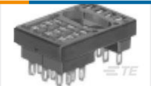
TE Part # 1-1393143-0 27E127=SOCKET,R10,22,SLG,PHE