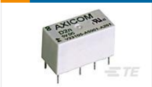
TE Part # 1393793-8 V23105A5403A201