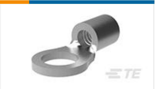
TE Part # 30692 TERM, BUDG, R 22-18 8