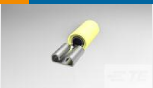
TE Part # 640907-2 RECEPT,PIDG FASTON 12-10 250