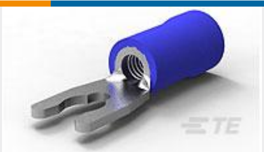
TE Part # 52955-1 TERMINAL,PG SPR SPD 16-14 6