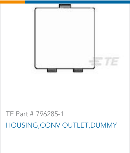
TE Part # 796285-1 HOUSING,CONV OUTLET,DUMMY