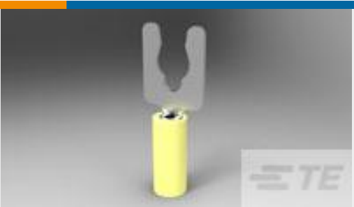
TE Part # 52941-1 TERMINAL,PIDG SPR SPD 12-10 6