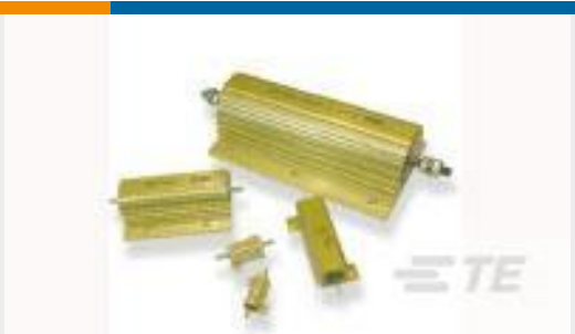
TE Part # 2-1625984-5 HSA50 1R2 5%