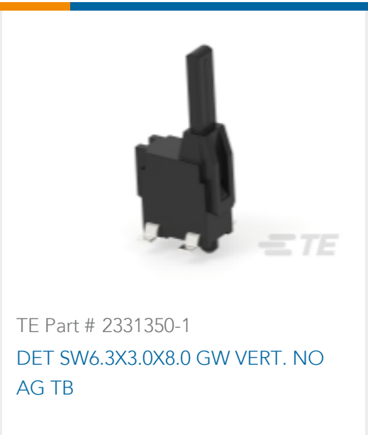
TE Part # 2331350-1 DET SW6.3X3.0X8.0 GW VERT. NO AG TB