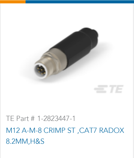
TE Part # 1-2823447-1 M12 A-M-8 CRIMP ST ,CAT7 RADOX 8.2MM,H&S