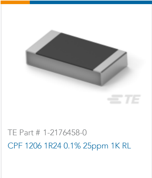
TE Part # 1-2176458-0 CPF 1206 1R24 0.1% 25ppm 1K RL