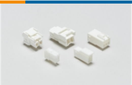
Rectangular Power Connectors(469)