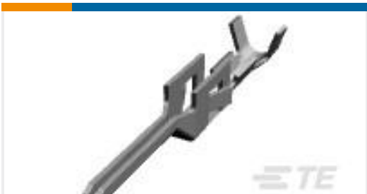
TE Part # 1-794613-1 PIN CONT 26-30 15 GOLD L/P