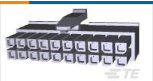
TE Part # 2-794617-0 20POS,MICRO MNL,RCPT HSG