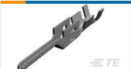
TE Part # 1-794612-1 PIN CONT 20-24 15 GOLD L/P