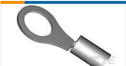
TE Part # 165297 SOLIS DIN 1.5-2.5 R M4