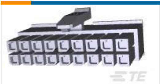
TE Part # 1-794617-8 18POS,MICRO MNL,RCPT HSG