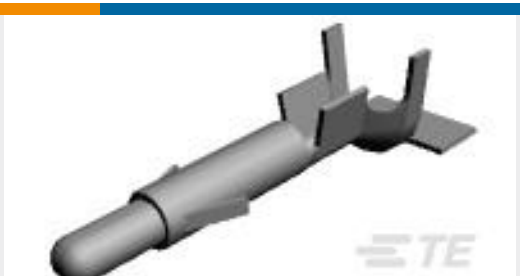
TE Part # 350707-1 UMNL SPLIT PIN 20-14 PTPBR L/P