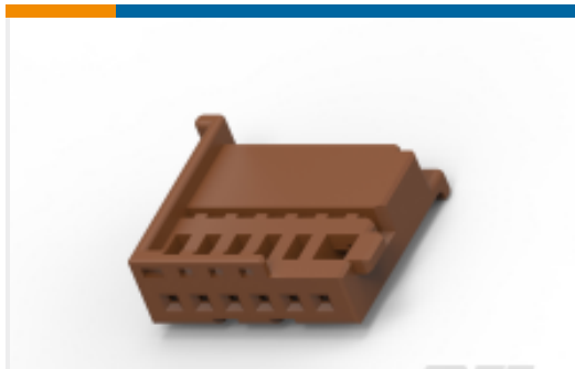
TE Part # 1-969489-2 6POS MQS REC COD A