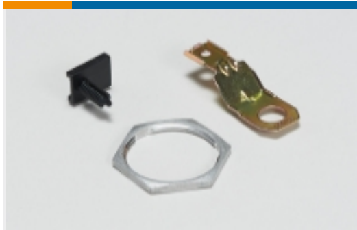
Other Automotive Connector Accessories(7)