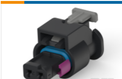
TE Part # 1-1718643-8 2POS, MCON 1.2 LL REC SEALED