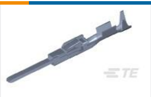
TE Part # 5-1418760-2 MCON 1.2 LL TAB STC AU