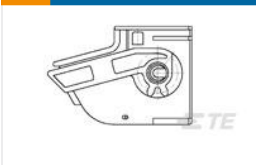
TE Part # 1-968321-2 MQS ABDECKKAPPE 40P