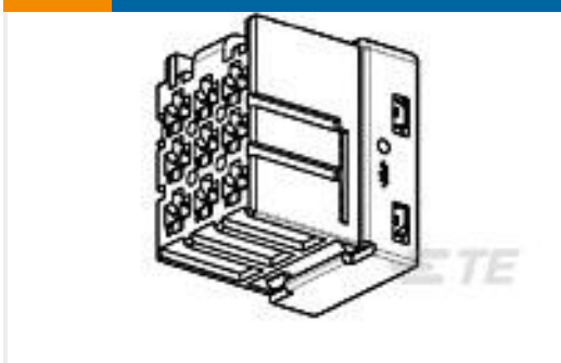
TE Part # 2-968307-2 JPT GEH KOMPL 9P