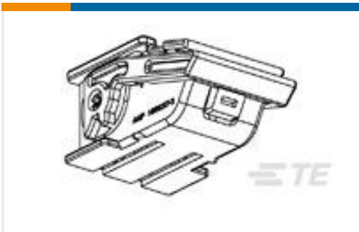
TE Part # 1-968317-3 MQS ABDECKKAPPE 24P