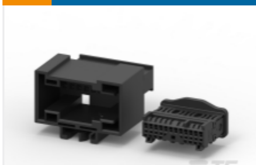
TE Part # 2-968318-1 MQS, CONNECTOR HOUSING