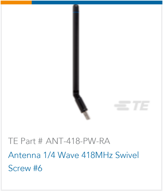
TE Part # ANT-418-PW-RA Antenna 1/4 Wave 418MHz Swivel Screw #6