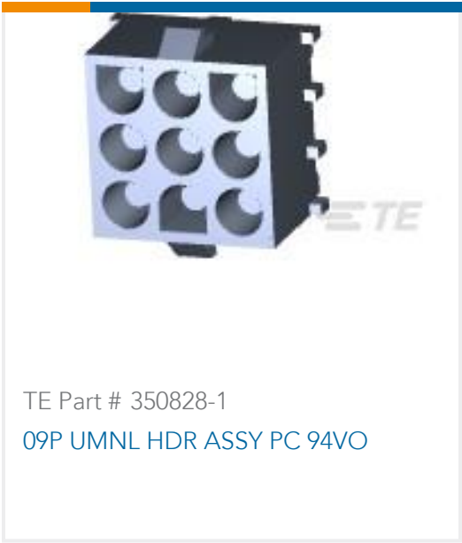
TE Part # 350828-1 09P UMNL HDR ASSY PC 94VO