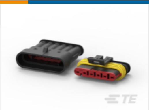
TE Part # 282104-1 AMP SUPERSEAL 1.5MM, CONNECTOR HOUSING