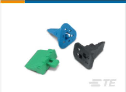
TE Part # W2S Wedgelocks: DEUTSCH DT