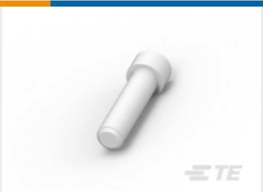
TE Part # 114017-ZZ SEALING PLUG, SIZE 12/16, WHT