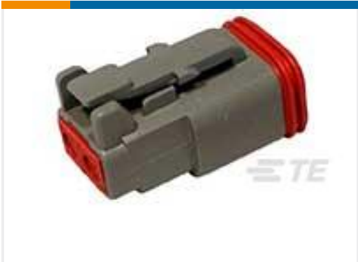
TE Part # DT06-2S PLG, 2P, GRY, N