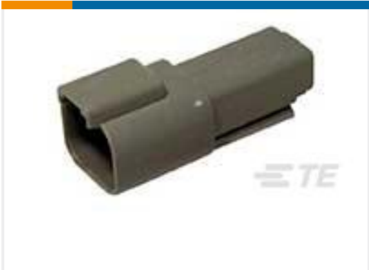
TE Part # DT04-2P REC, 2P, GRY, N