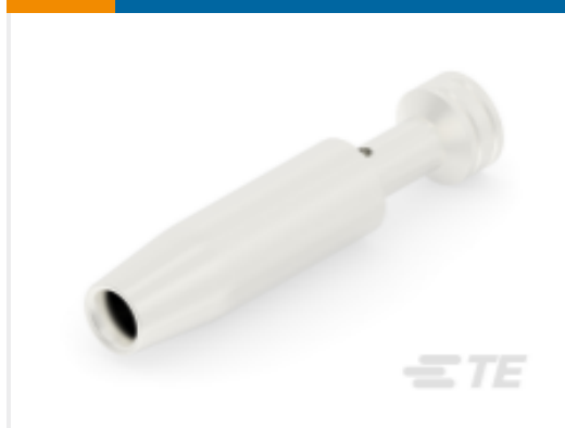
TE Part # T2030032008-000 HEF-0.75