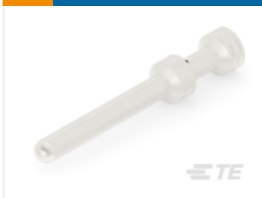
TE Part # T2030031008-000 HEM-0.75,L=28