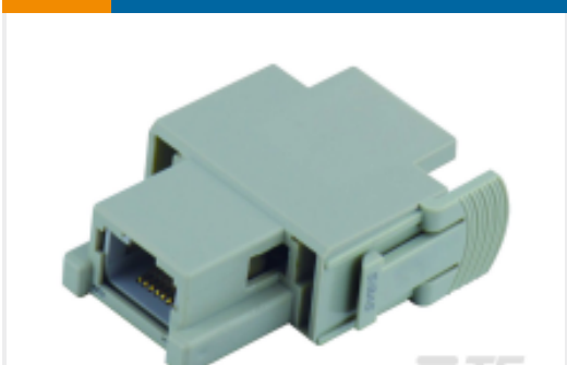
TE Part # T2113000201-000 HMN-RJ45-F