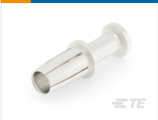
TE Part # T2400032100-002 HSF-10(10 sq mm),HIGH MATING CYCLES