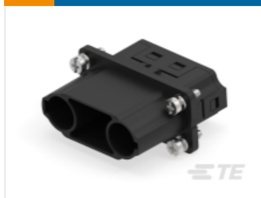
TE Part # T2120062101-001 HK2/4-006-M