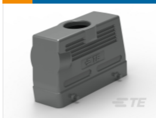
TE Part # T1240240132-000 H24B-TGH-M32