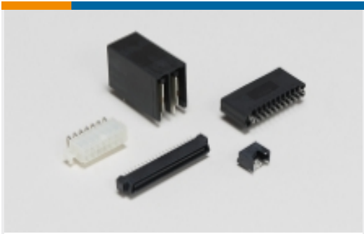
Standard Rectangular Connectors(32)