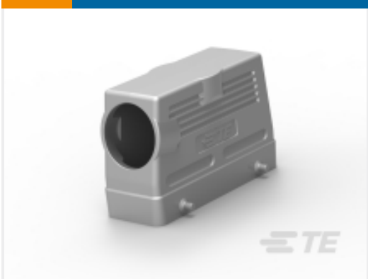
TE Part # T1230240140-000 H24B-TSH-M40