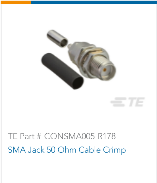
TE Part # CONSMA005-R178 SMA Jack 50 Ohm Cable Crimp