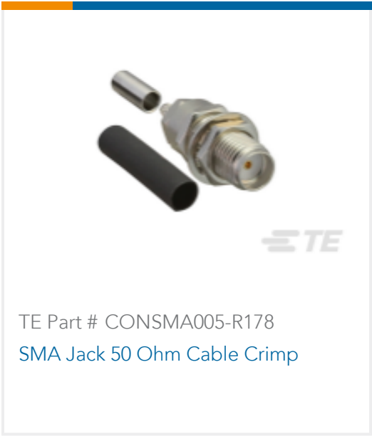
TE Part # CONSMA005-R178 SMA Jack 50 Ohm Cable Crimp