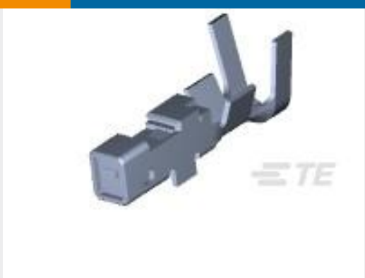
TE Part # 1827571-2 DYNAMIC D1000 REC CONT L AU 0.38 um FORM