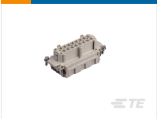
TE Part # T2040163201-000 HE-016-FS