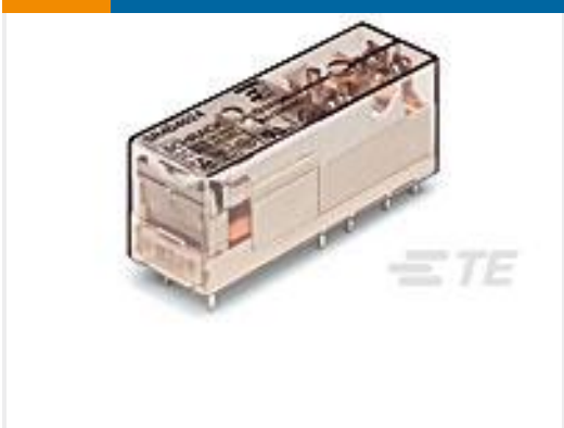
TE Part # 7-1415054-1 SR4D4005