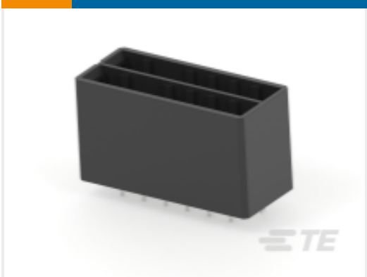
TE Part # 1-917658-5 Header Assembly: Wire-to-Board, 15A, gold or tin plated