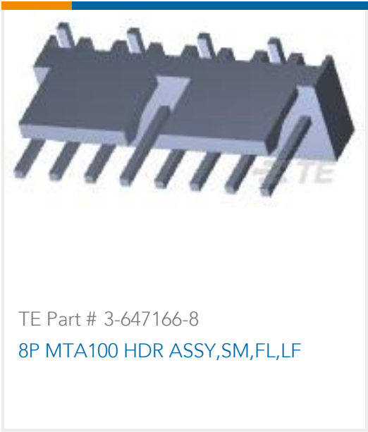
TE Part # 3-647166-8 8P MTA100 HDR ASSY,SM,FL,LF