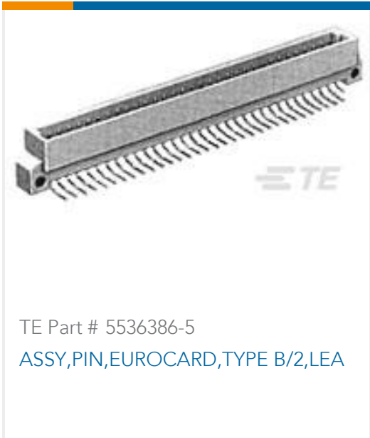
TE Part # 5536386-5 ASSY,PIN,EUROCARD,TYPE B/2,LEA