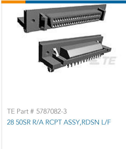
TE Part # 5787082-3 28 50SR R/A RCPT ASSY,RDSN L/F