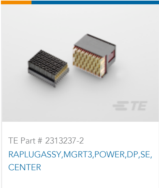
TE Part # 2313237-2 RAPLUGASSY,MGRT3,POWER,DP,SE, CENTER