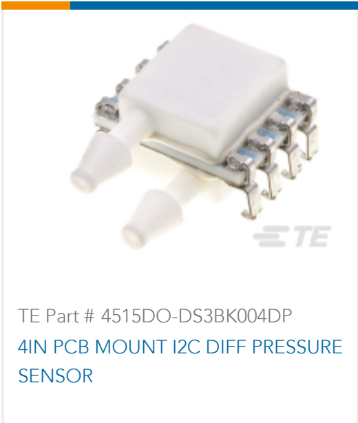
TE Part # 4515DO-DS3BK004DP 4IN PCB MOUNT I2C DIFF PRESSURE SENSOR