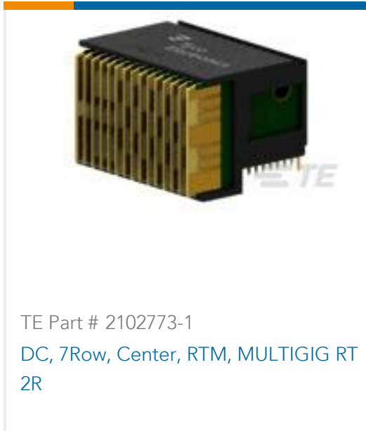
TE Part # 2102773-1 DC, 7Row, Center, RTM, MULTIGIG RT 2R