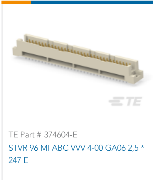
TE Part # 374604-E STVR 96 MI ABC VVV 4-00 GA06 2,5 * 247 E

Assembly, Vertical SMT Header, 2-Positio