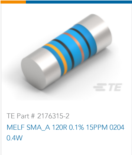
TE Part # 2176315-2 MELF SMA_A 120R 0.1% 15PPM 0204 0.4W