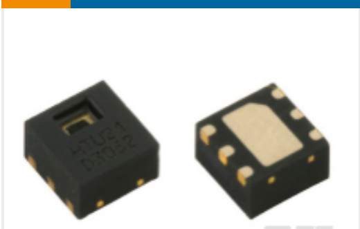
TE Part # HPP845E031R4 I.C 21D RH/T B400