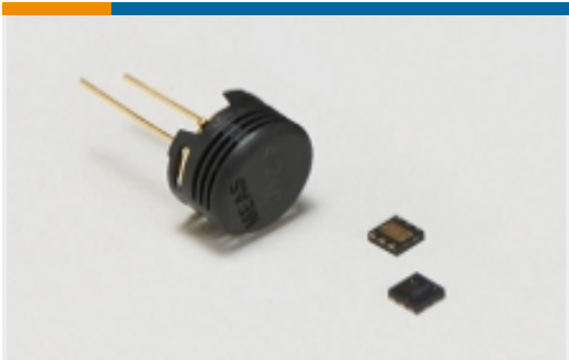
Humidity Sensor Components(18)