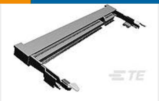
TE Part # 5-1746530-4 SEMI-HARD TRAY DDR2 SODIMM 6.5 H STD(HSG)