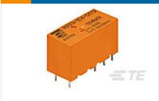
TE Part # 2-1415899-2 RZ03-1C4-D012