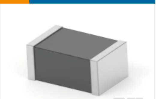
TE Part # 1-2176486-6 BMC 0805 470R 25% A Gen C