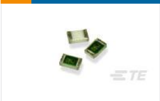
TE Part # 7-1676481-0 CPF 0603 5K1 0.1% 25PPM 1K RL