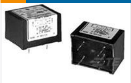
TE Part # 6609065-3 6EDP=F7689 S0